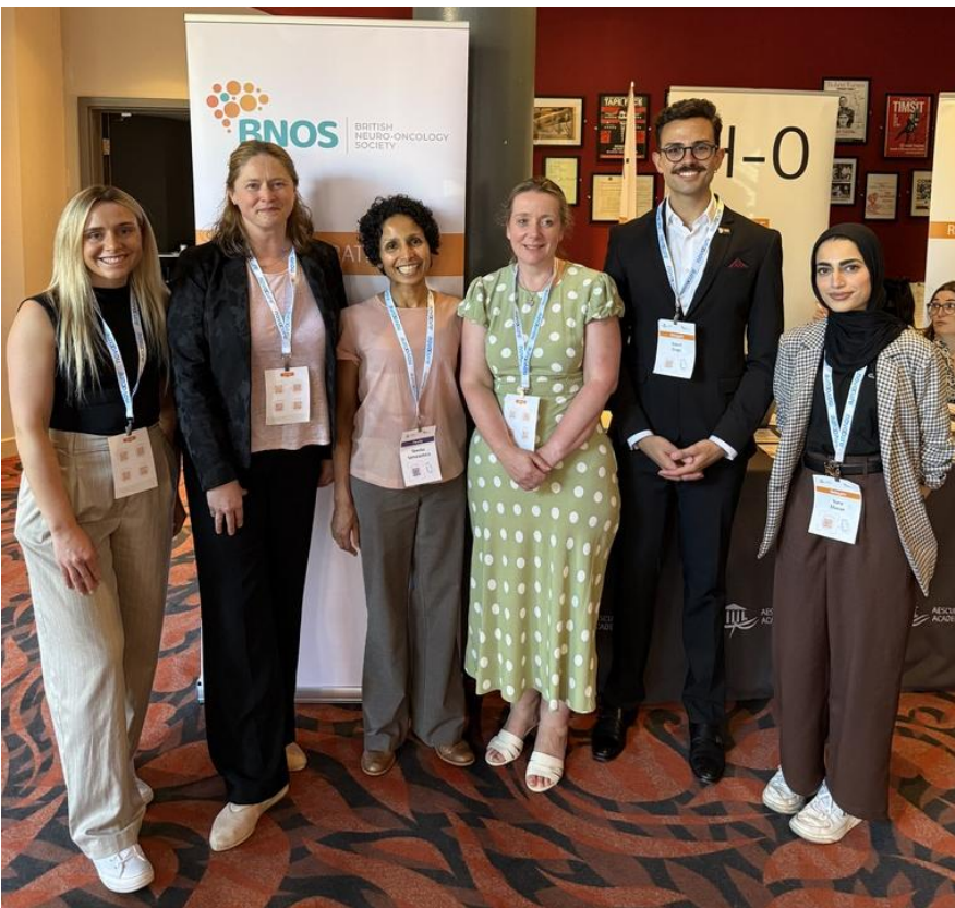
Members of the Queen Elizabeth Hospital, Birmingham team at the BNOS 2025 meeting in London.