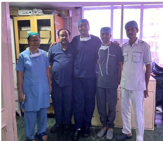
With the neurosurgical residents, the advanced scrub nurse and the OT technician